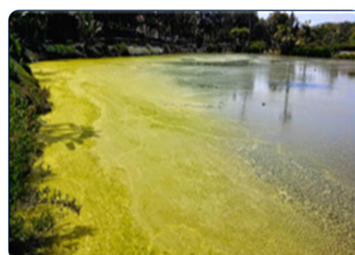
Fig 1. Eutrophic Lake (example target water type for phytoremediation)