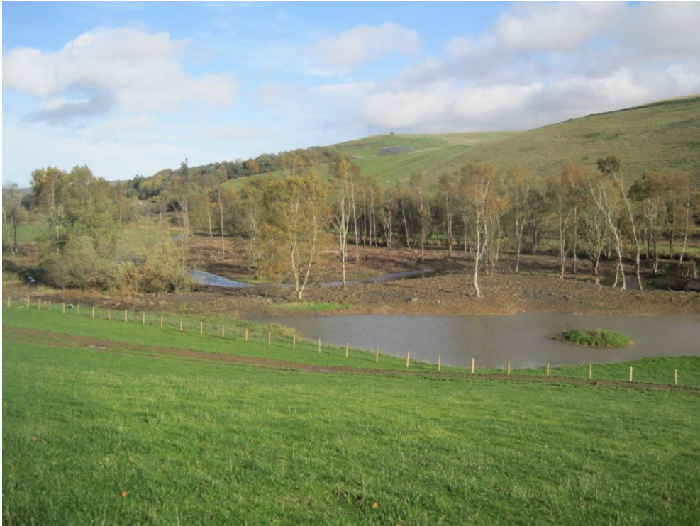
Eddlestone Water remeandering