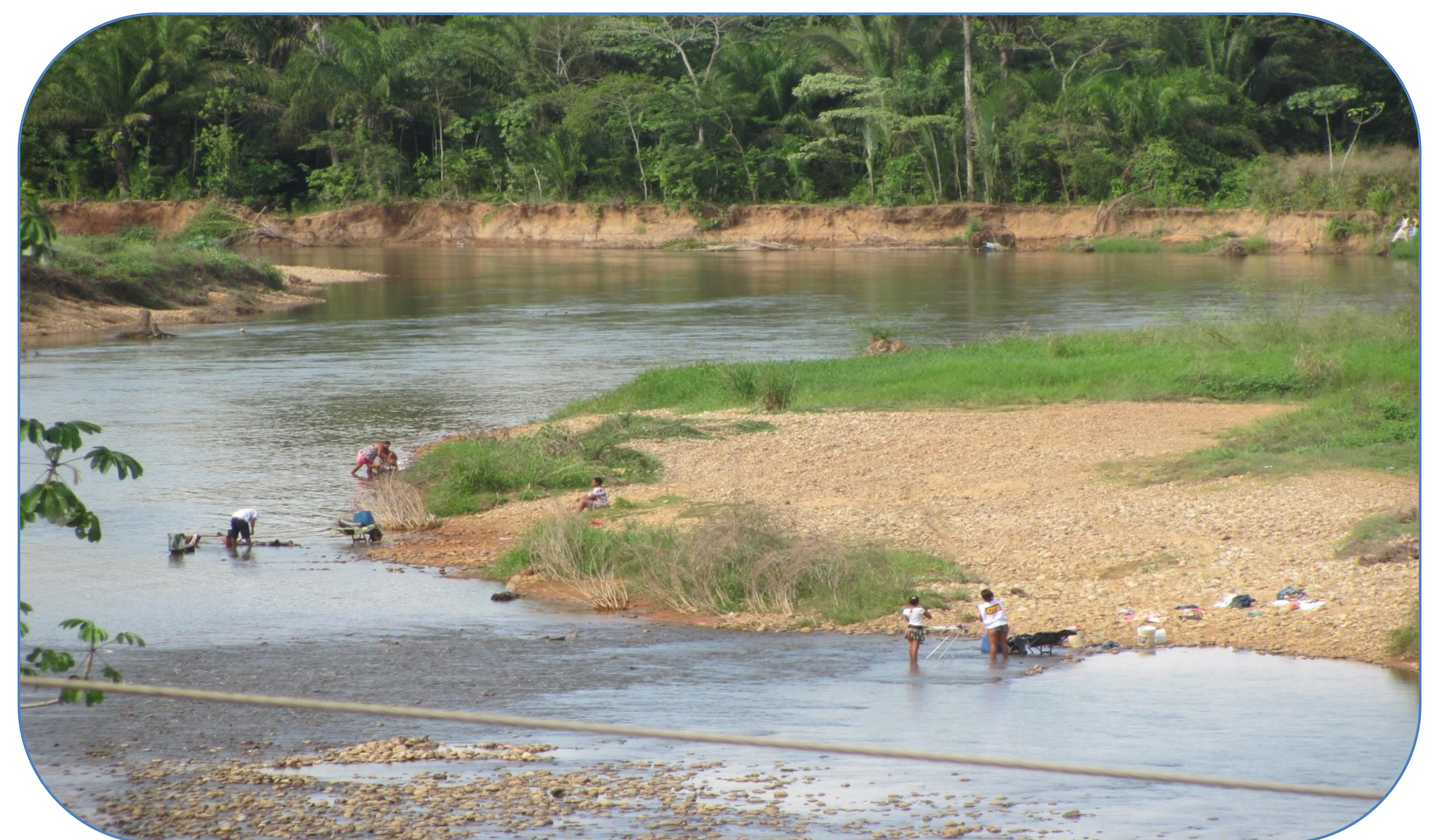
Settlers washing their clothes in the river, as seen on the road between Jaciara and Poxoréu, Mato Grosso, Brazil