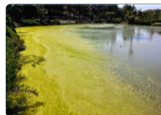
Fig.2: Eutrophic lake (example target water type for phytoremediation)

Deploy macrophyte communities in waters impacted by multi-diffuse pollutants including field ditches, aquacultural effluents & eutrophic lakes.