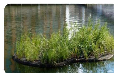
Fig.3: Floating Treatment Wetland

Novel ecological engineering solutions including floating treatment wetlands will also be employed to facilitate maximum pollutant removal and efficient harvesting.